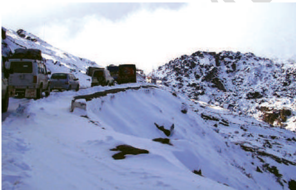
Fig. 7.4: Traffic on north-eastern border road (Arunachal Pradesh)

Roads can also be classified on the basis of the type of material used for their construction such as metalled and unmetalled roads. Metalled roads may be made of cement, concrete or even bitumen of coal, therefore,