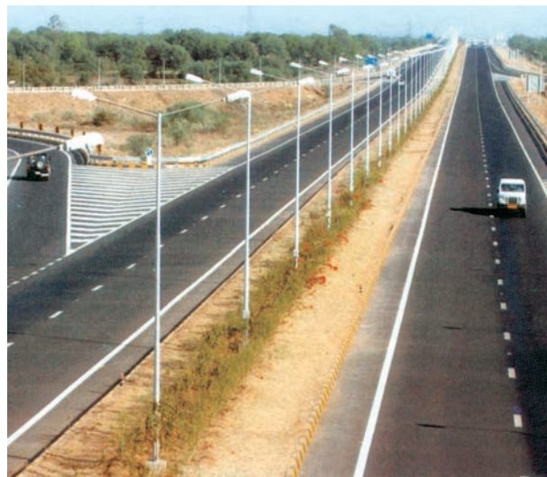
Fig. 7.2: Ahmedabad- Vadodara Expressway