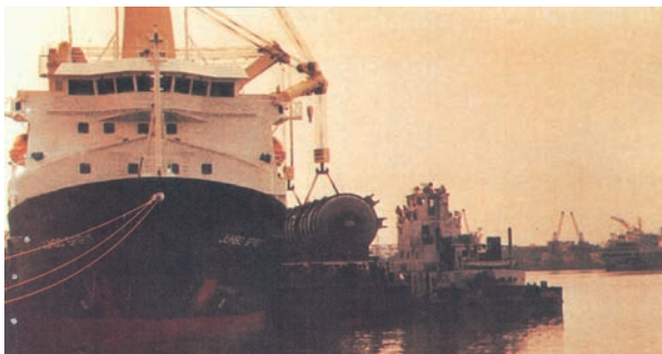
Fig. 7.8: Handling of oversize cargo at Tuticorin port

even our neighbouring countries like Sri Lanka, Maldives, etc. and the coastal regions of India. Chennai is one of the oldest artificial ports of the country. It is ranked next to Mumbai in terms of the volume of trade and cargo. Vishakhapatnam is the deepest landlocked and well-protected port. This port was, originally, conceived as an outlet for iron ore exports. Paradwip port located in Odisha, specialises in the export of iron ore. Kolkata is an inland riverine port. This port serves a very large and rich hinterland of Ganga-Brahmaputra basin. Being a tidal port, it requires constant dredging of Hoogly. Haldia port was developed as a subsidiary port, in order to relieve growing pressure on the Kolkata port.