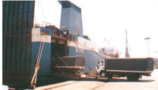
Fig. 7.6: Trucks being driven into the vessel at Mumbai port

Deendayal Port, is a tidal port. It caters to the convenient handling of exports and imports of highly productive granary and industrial belt stretching across UT of Jammu and Kashmir, and the states of Himachal Pradesh, Punjab, Haryana, Rajasthan and Gujarat.