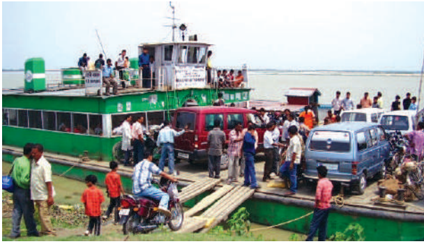
Fig. 7.5: Inland waterways widely used in north-eastern states