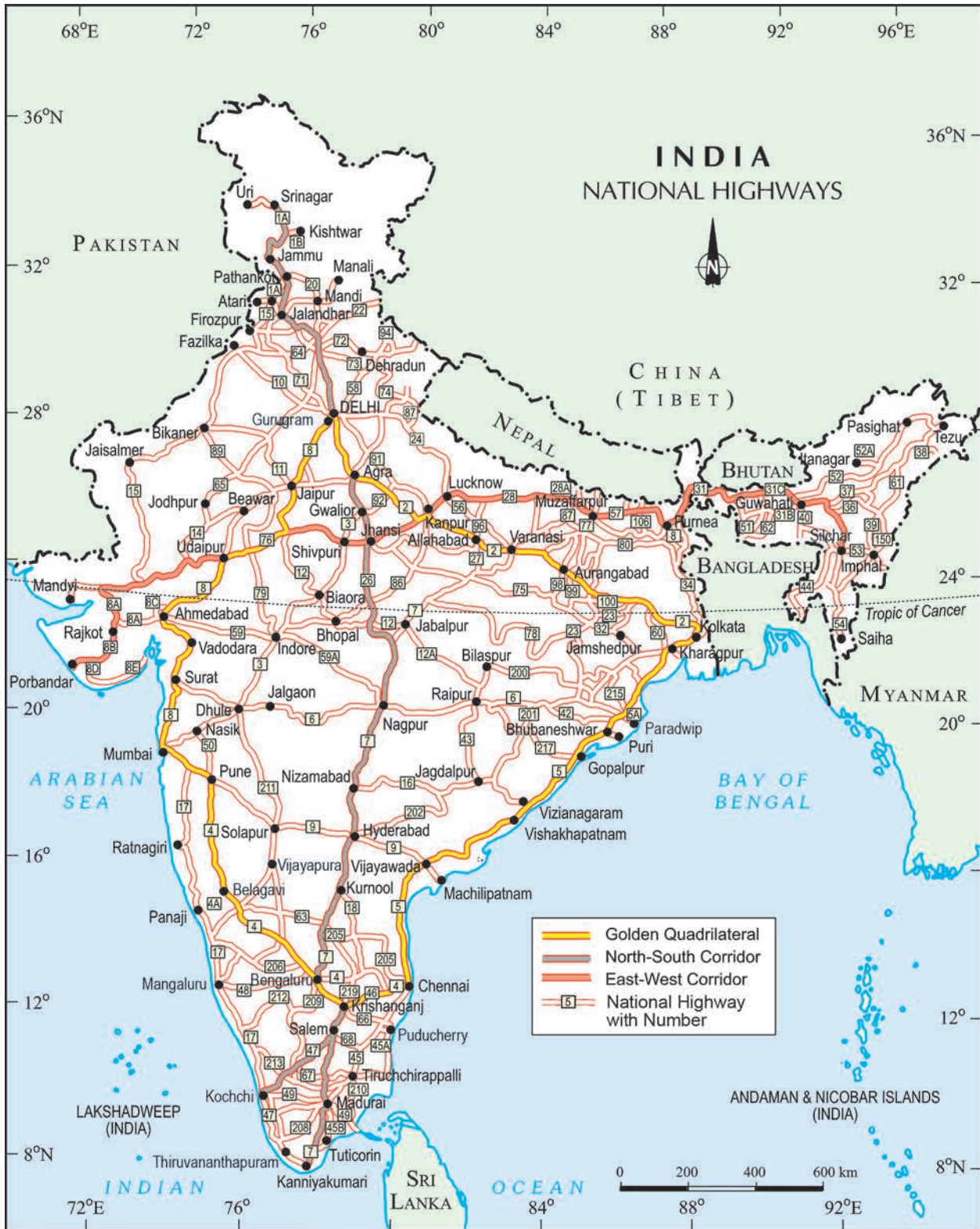
India: National Highways