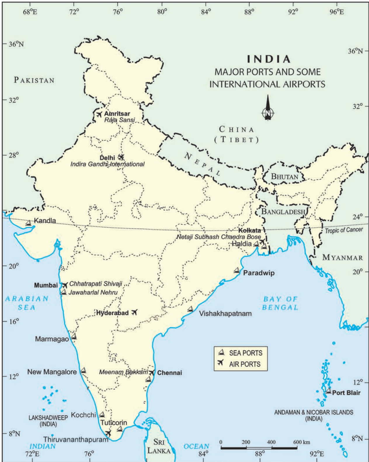
India: Major Ports and Some International Airports