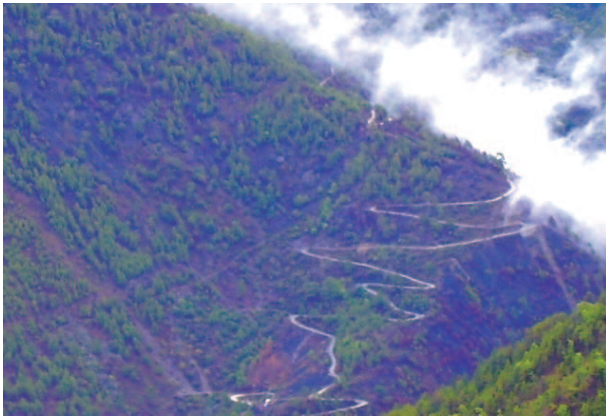
Fig. 7.3: Hilly Tracts