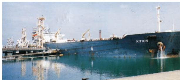
Fig. 7.7: Tanker discharging crude oil at New Mangalore port

Mumbai is the biggest port with a spacious natural and well-sheltered harbour. The Jawaharlal Nehru port was planned with a view to decongest the Mumbai port and serve as a hub port for this region. Marmagao port (Goa) is the premier iron ore exporting port of the country. This port accounts for about fifty per cent of India's iron ore export. New Mangalore port, located in Karnataka caters to the export of iron ore concentrates from Kudremukh mines. Kochchi is the extreme south-western port, located at the entrance of a lagoon with a natural harbour.