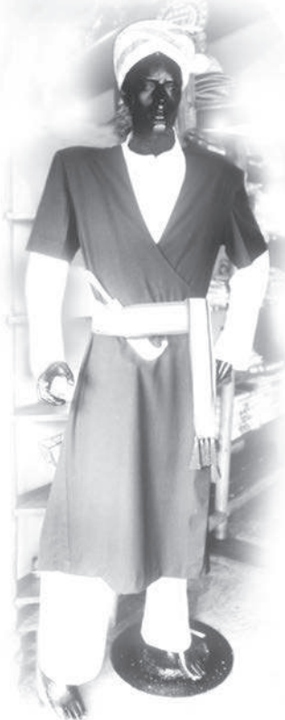
Traditional Coorgi dress

some showers thrown in for good measure. The air breathes of invigorating coffee. Coffee estates and colonial bungalows stand tucked under tree canopies in prime corners.