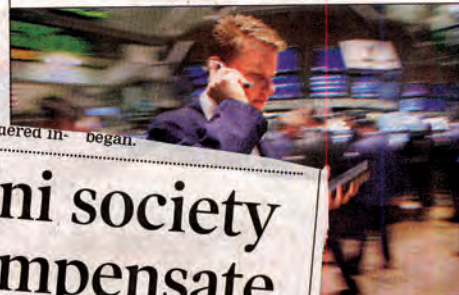
ordered in- began.