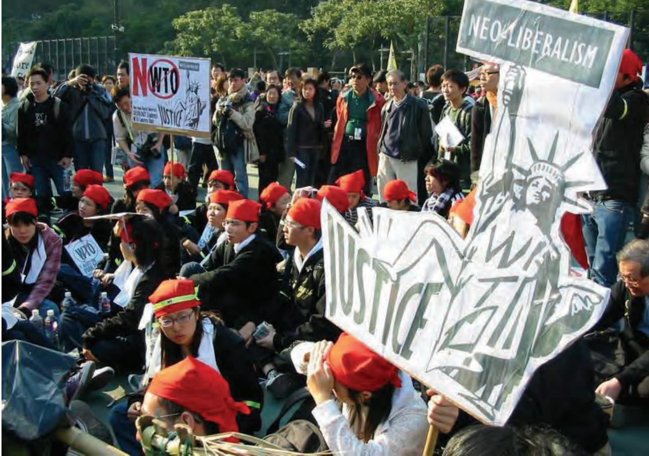
A demonstration against WTO in Hong Kong, 2005