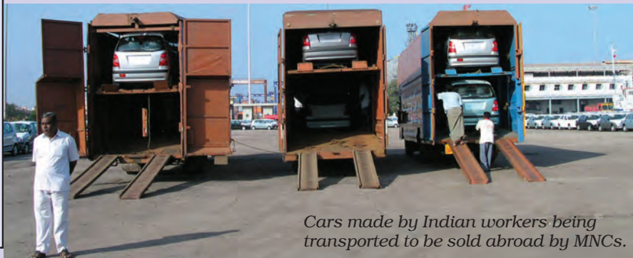
Cars made by Indian workers being transported to be sold abroad by MNCs.