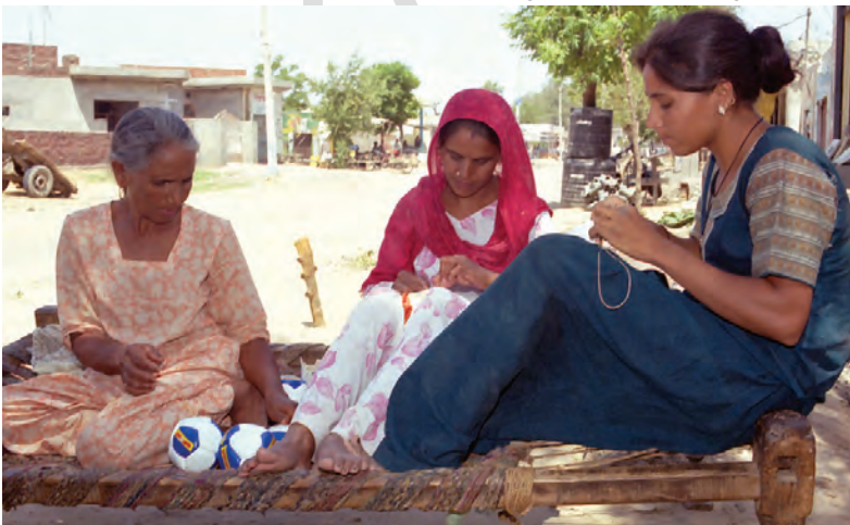
Women at home in Ludhiana making footballs for large MNCs

There's another way in which MNCs control production. Large MNCs in developed countries place orders for production with small producers. Garments, footwear, sports items are examples of industries where production is carried out by a large number of small producers around the world.