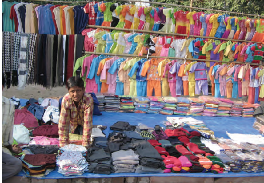
Small traders of readymade garments facing stiff competition from both the MNC brands and imports.

In general, with the opening of trade, goods travel from one market to another. Choice of goods in the markets rises. Prices of similar goods in the two markets tend to become equal. And, producers in the two countries now closely compete against each other even though they are separated by thousands of miles! Foreign trade thus results in connecting the markets or integration of markets in different countries.