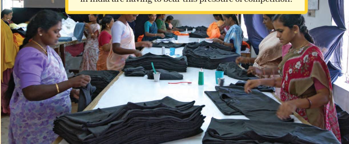
Factory workers folding garments for export. Though globalisation has created opportunities for paid work for women, the condition of employment shows that women are denied their fair share of benefits.

Let us see how the workers in the garment export industry in India are having to bear this pressure of competition.