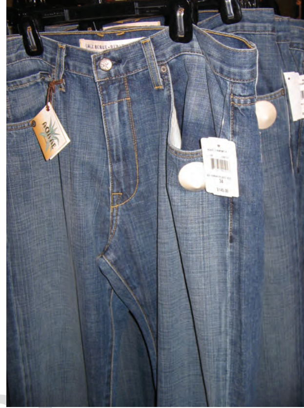
Jeans produced in developing countries being sold in USA for Rs 6500 ($145)

The products are supplied to the MNCs, which then sell these under their own brand names to the customers. These large MNCs have tremendous power to determine price, quality, delivery, and labour conditions for these distant producers.