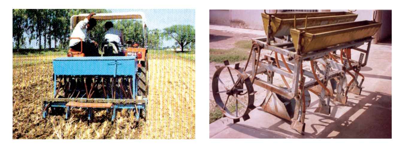
Fig. 4.15: Modern technological equipments used in agriculture

reforms. Provision for crop insurance against drought, flood, cyclone, fire and disease, establishment of Grameen banks, cooperative societies and banks for providing loan facilities to the farmers at lower rates of interest were some important steps in this direction.