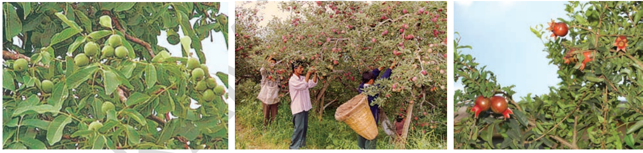
Fig. 4.12: Apricots, apple and pomegranate

Horticulture Crops: In 2018, India was the second largest producer of fruits and vegetables in the world after China. India is a producer of tropical as well as temperate fruits. Mangoes of Maharashtra, Andhra Pradesh, Telangana, Uttar Pradesh and West Bengal, oranges of Nagpur and Cherrapunjee (Meghalaya), bananas of Kerala, Mizoram, Maharashtra and Tamil Nadu, lichi and guava of Uttar Pradesh and Bihar, pineapples of Meghalaya, grapes of Andhra Pradesh, Telangana and Maharashtra, apples, pears, apricots and walnuts of Jammu and Kashmir and Himachal Pradesh are in great demand the world over.