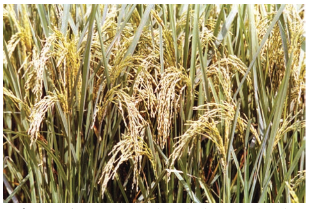
Fig. 4.4 (b): Rice is ready to be harvested in the field