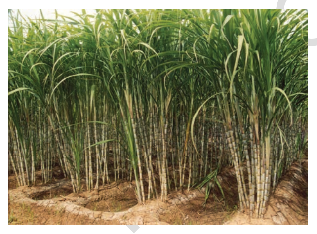
Fig. 4.8: Sugarcane Cultivation

Sugarcane: It is a tropical as well as a subtropical crop. It grows well in hot and humid climate with a temperature of 21°C to 27°C and an annual rainfall between 75cm. and 100cm. Irrigation is required in the regions of low rainfall. It can be grown on a variety of soils and needs manual labour from