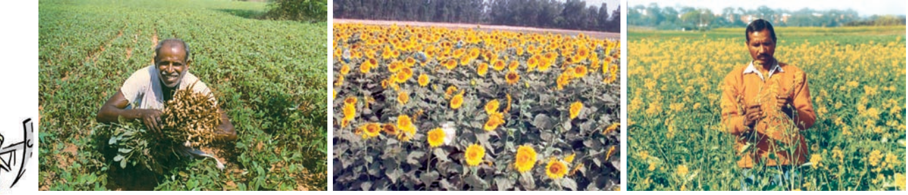
Fig. 4.9: Groundnut, sunflower and mustard are ready to be harvested in the field

Tea: Tea cultivation is an example of plantation agriculture. It is also an important beverage crop introduced in India initially by the British. Today, most of the tea plantations are owned by Indians. The tea plant grows well in tropical and sub-tropical climates endowed with deep and fertile well-drained soil, rich in humus and organic matter. Tea bushes require warm and moist frost-free