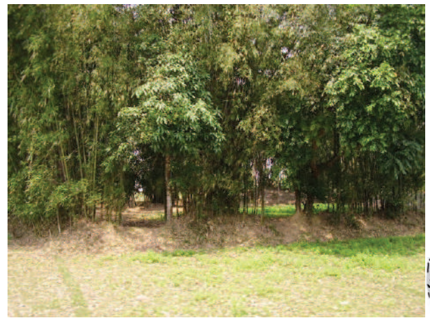
Fig. 4.3: Bamboo plantation in North-east