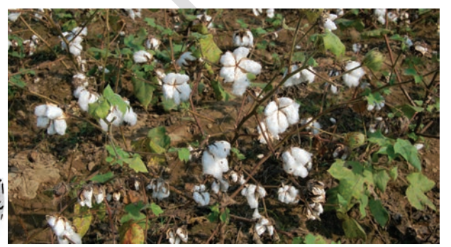
Fig. 4.14: Cotton Cultivation

Cotton: India is believed to be the original home of the cotton plant. Cotton is one of the main raw materials for cotton textile industry. In 2017, India was second largest producer of cotton after China. Cotton grows well in drier parts of the black cotton soil of the Deccan plateau. It requires high temperature, light rainfall or irrigation, 210 frost-free days and bright sun-shine for its growth. It is a kharif crop and requires 6 to 8 months to mature. Major cotton-producing states are– Maharashtra, Gujarat, Madhya Pradesh,