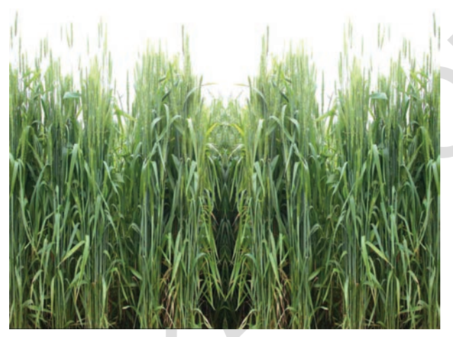
Fig. 4.5: Wheat Cultivation

Wheat: This is the second most important cereal crop. It is the main food crop, in north and north-western part of the country. This rabi crop requires a cool growing season and a bright sunshine at the time of ripening. It requires 50 to 75 cm of annual rainfall evenly-distributed over the growing season. There are two important wheat-growing zones in the country – the Ganga-Satluj plains in the north-west and black soil region of the Deccan. The major wheat-producing states are Punjab, Haryana, Uttar Pradesh, Madhya Pradesh, Bihar and Rajasthan.