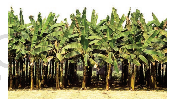
Fig. 4.2: Banana plantation in Southern part of India

In India, tea, coffee, rubber, sugarcane, banana, etc., are important plantation crops. Tea in Assam and North Bengal coffee in Karnataka are some of the important plantation crops grown in these states. Since the production is mainly for market, a welldeveloped network of transport and communication connecting the plantation areas, processing industries and markets plays an important role in the development of plantations.