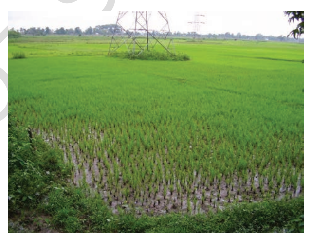
Fig. 4.4 (a): Rice Cultivation

Rice: It is the staple food crop of a majority of the people in India. Our country is the second largest producer of rice in the world after China. It is a kharif crop which requires high temperature, (above 25°C) and high humidity with annual rainfall above 100 cm. In the areas of less rainfall, it grows with the help of irrigation.