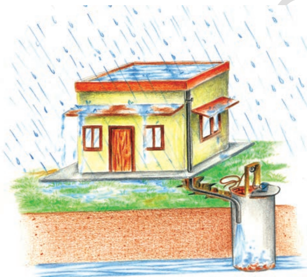
(b) Recharge through Abandoned Dugwell