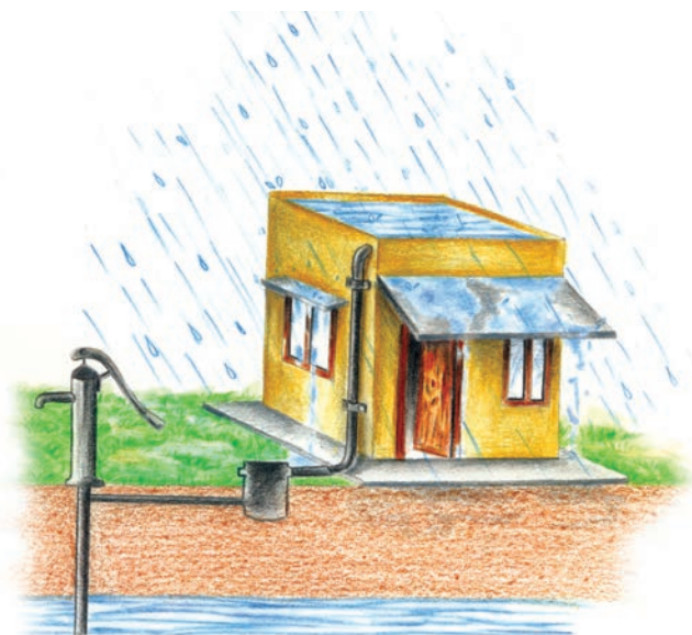
(a) Recharge through Hand Pump

irrigate their fields. In arid and semi-arid regions, agricultural fields were converted into rain fed storage structures that allowed the water to stand and moisten the soil like the 'khadins' in Jaisalmer and 'Johads' in other parts of Rajasthan.