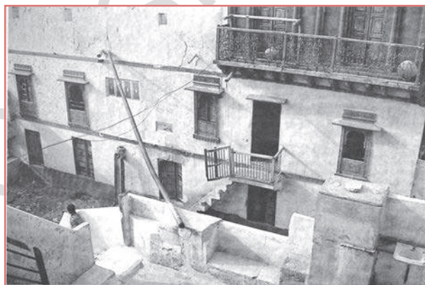
Rooftop harvesting was common across the towns and villages of the Thar. Rainwater that falls on the sloping roofs of houses is taken through a pipe into an underground tanka (circular holes in the ground), built in the main house or in the courtyard. The picture above shows water being taken from a neighbour's roof through a long pipe. Here the neighbour's rooftop has been used for collection of rainwater. The picture shows a hole through which rainwater flows down into an underground tanka .

Fortunately, in many parts of rural and urban India, rooftop rainwater harvesting is being successfully adapted to store and conserve water. In Gendathur, a remote backward village in Mysuru, Karnataka, villagers have installed, in their household's rooftop, rainwater harvesting system to meet their water needs. Nearly 200 households have installed this system and the village has earned the rare distinction of being rich in rainwater. See Fig. 3.6 for a better understanding of the rooftop rainwater harvesting system which is adapted here. Gendathur receives an annual precipitation of 1,000 mm, and with 80 per cent of collection efficiency and of about 10 fillings, every house can collect and use about 50,000 litres of water annually. From the 200 houses, the net amount of rainwater harvested annually amounts to 1,00,000 litres.