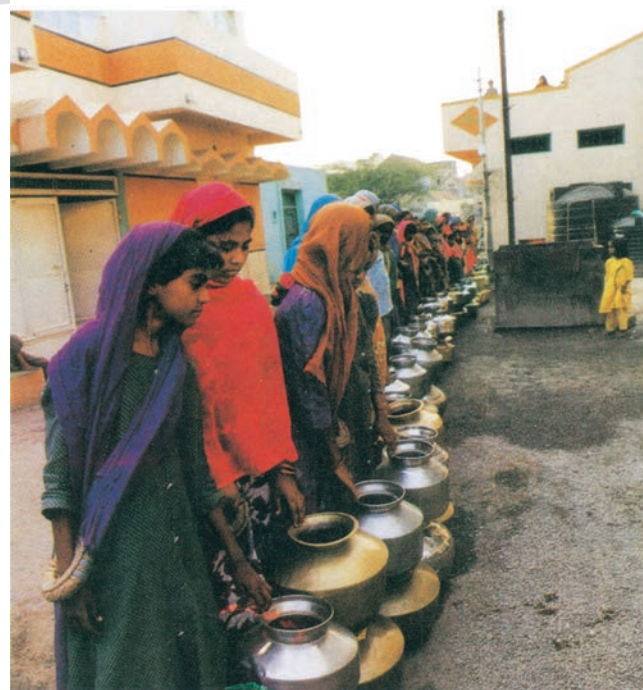
Fig. 3.1: Water Scarcity

एक ओर इजराइल जैसे 25 सेमी. औसत वार्षिक वर्षा वाले देश में जल का कोई अभाव नहीं है तो दूसरी ओर 114 सेमी. औसत वार्षिक वर्षा वाले हमारे देश में प्रति वर्ष किसी भाग में सूखा अवश्य पड़ता है। देश में जल की उपलब्धता और उसके स्वरूप के अनुसार समुचित जलप्रबंधन न होने के कारण ही वर्षा का जल नदी-नालों में तेजी से बहकर समुद्र में चला जाता है जिससे वर्षा के बाद के लगभग नौ महीने देश के लिए पानी की कमी के होते हैं। ये ही मूल कारण हैं देश में जलीय अभाव के, जिसे हम उचित प्रबंधन के द्वारा ही नियंत्रित कर सकते हैं।