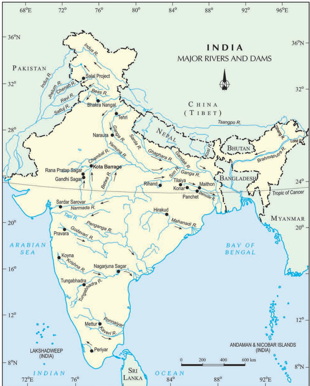
India: Major Rivers and Dams