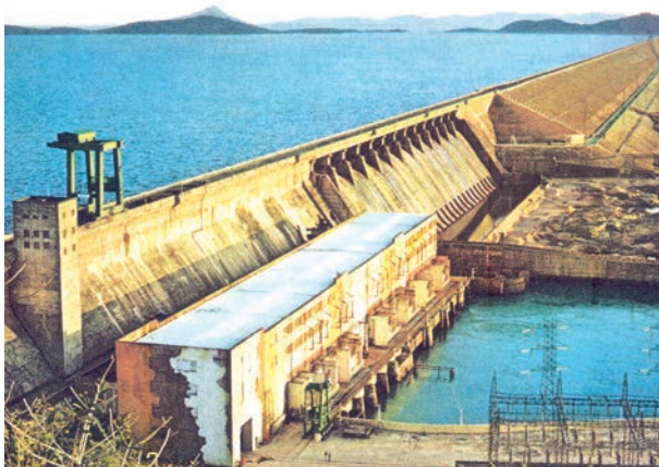
Fig. 3.2: Hirakud Dam

What are dams and how do they help us in conserving and managing water? Dams were traditionally built to impound rivers and rainwater that could be used later to irrigate agricultural fields. Today, dams are built not just for irrigation but for electricity generation, water supply for domestic and industrial uses, flood control, recreation, inland navigation and fish breeding. Hence, dams are now referred to as multi-purpose projects where the many uses of the impounded water are integrated with one another. For example, in the Sutluj-Beas river basin, the Bhakra – Nangal project water is being used both for hydel power production and irrigation. Similarly, the Hirakud project in the Mahanadi basin integrates conservation of water with flood control.