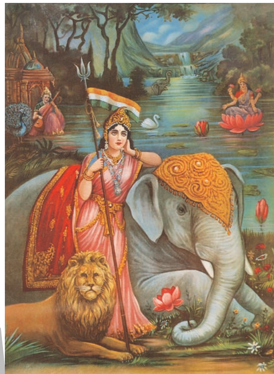
Fig. 14a – Bharat Mata.

This figure of Bharat Mata is a contrast to the one painted by Abanindranath Tagore. Here she is shown with a trishul, standing beside a lion and an elephant – both symbols of power and authority.