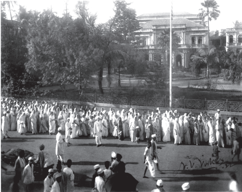
Fig. 9 – Women join nationalist processions. During the national movement, many women, for the first time in their lives, moved out of their homes on to a public arena. Amongst the marchers you can see many old women, and mothers with children in their arms.

picketed foreign cloth and liquor shops. Many went to jail. In urban areas these women were from high-caste families; in rural areas they came from rich peasant households. Moved by Gandhiji's call, they began to see service to the nation as a sacred duty of women. Yet, this increased public role did not necessarily mean any radical change in the way the position of women was visualised. Gandhiji was convinced that it was the duty of women to look after home and hearth, be good mothers and good wives. And for a long time the Congress was reluctant to allow women to hold any position of authority within the organisation. It was keen only on their symbolic presence.