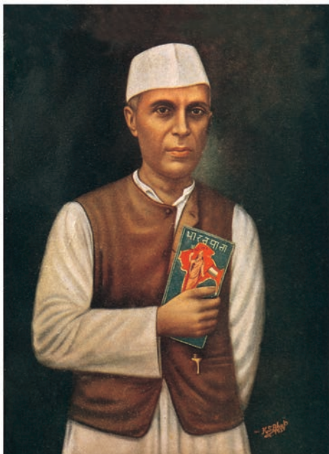
Fig. 13 – Jawaharlal Nehru, a popular print. Nehru is here shown holding the image of Bharat Mata and the map of India close to his heart. In a lot of popular prints, nationalist leaders are shown offering their heads to Bharat Mata. The idea of sacrifice for the mother was powerful within popular imagination.