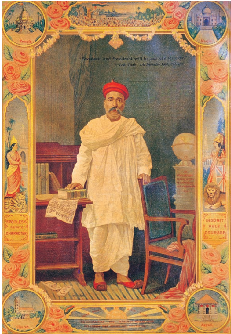
Fig. 11 – Bal Gangadhar Tilak, an early-twentieth-century print. Notice how Tilak is surrounded by symbols of unity. The sacred institutions of different faiths (temple, church, masjid) frame the central figure.

Nationalism spreads when people begin to believe that they are all part of the same nation, when they discover some unity that binds them together. But how did the nation become a reality in the minds of people? How did people belonging to different communities, regions or language groups develop a sense of collective belonging?