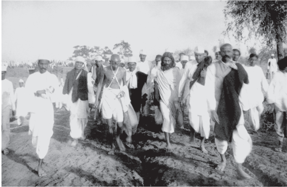
Fig. 7 – The Dandi march. During the salt march Mahatma Gandhi was accompanied by 78 volunteers. On the way they were joined by thousands.

with the British, as they had done in 1921-22, but also to break colonial laws. Thousands in different parts of the country broke the salt law, manufactured salt and demonstrated in front of government salt factories. As the movement spread, foreign cloth was boycotted, and liquor shops were picketed. Peasants refused to pay revenue and chankidari taxes, village officials resigned, and in many places forest people violated forest laws – going into Reserved Forests to collect wood and graze cattle.