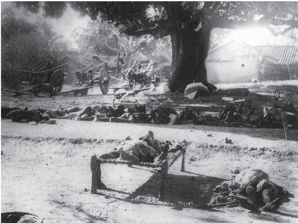
Fig. 5 – Chauri Chaura, 1922.

The visions of these movements were not defined by the Congress programme. They interpreted the term swaraj in their own ways, imagining it to be a time when all suffering and all troubles would be over. Yet, when the tribals chanted Gandhiji's name and raised slogans demanding ' Swatantra Bharat ', they were also emotionally relating to an all-India agitation. When they acted in the name of Mahatma Gandhi, or linked their movement to that of the Congress, they were identifying with a movement which went beyond the limits of their immediate locality.