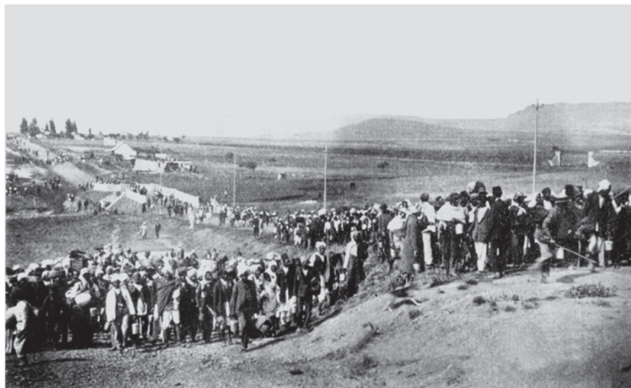
Fig. 2 – Indian workers in South Africa march through Volksrust, 6 November 1913.

Forced recruitment – A process by which the colonial state forced people to join the army