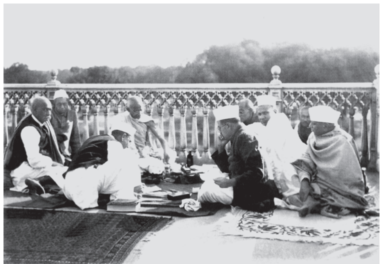
Fig. 6 – Meeting of Congress leaders at Allahabad, 1931. Apart from Mahatma Gandhi, you can see Sardar Vallabhbhai Patel (extreme left), Jawaharlal Nehru (extreme right) and Subhas Chandra Bose (fifth from right).

Lala Lajpat Rai was assaulted by the British police during a peaceful demonstration against the Simon Commission. He succumbed to injuries that were inflicted on him during the demonstration.