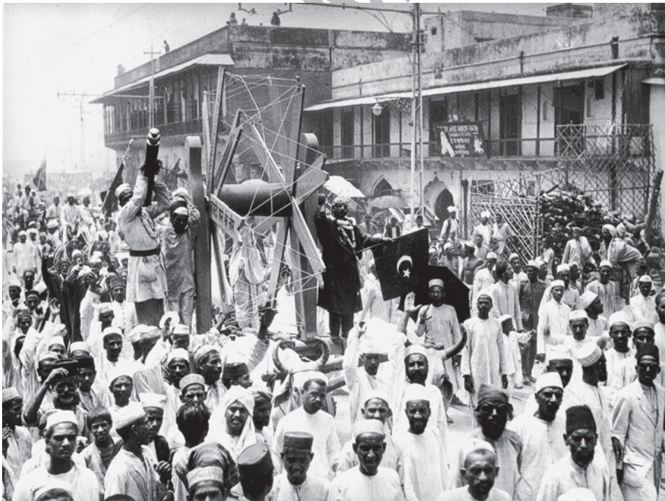
Fig. 4 – The boycott of foreign cloth, July 1922. Foreign cloth was seen as the symbol of Western economic and cultural domination.

Boycott – The refusal to deal and associate with people, or participate in activities, or buy and use things; usually a form of protest