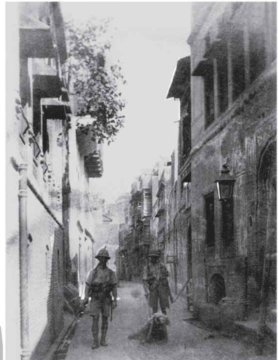
Fig. 3 – General Dyer's 'crawling orders' being administered by British soldiers, Amritsar, Punjab, 1919.

In his famous book Hind Swaraj (1909) Mahatma Gandhi declared that British rule was established in India with the cooperation of