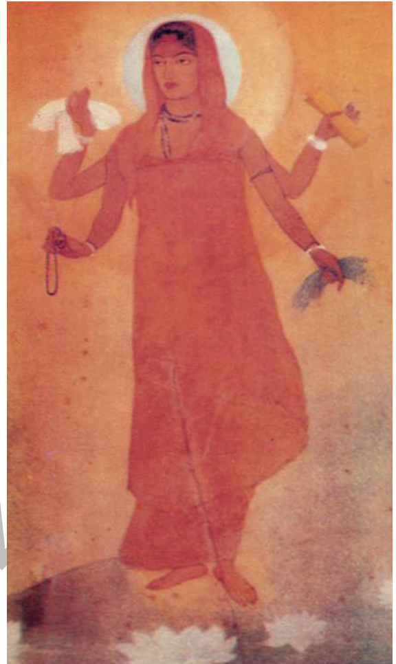
Fig. 12 – Bharat Mata, Abanindranath Tagore, 1905. Notice that the mother figure here is shown as dispensing learning, food and clothing. The mala in one hand emphasises her ascetic quality. Abanindranath Tagore, like Ravi Varma before him, tried to develop a style of painting that could be seen as truly Indian.

Ideas of nationalism also developed through a movement to revive Indian folklore. In late-nineteenth-century India, nationalists began recording folk tales sung by bards and they toured villages to gather folk songs and legends. These tales, they believed, gave a true picture of traditional culture that had been corrupted and damaged by outside forces. It was essential to preserve this folk tradition in order to discover one’s national identity and restore a sense of pride in one’s past. In Bengal, Rabindranath Tagore himself began collecting ballads, nursery rhymes and myths, and led the movement for folk